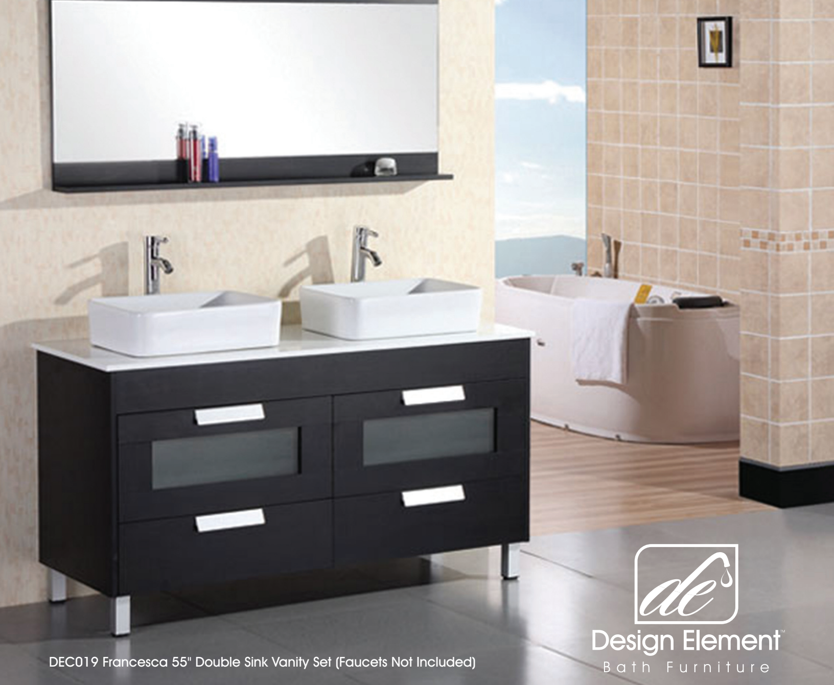
DEC019 Francesca 55" Double Sink Vanity Set (Faucets Not Included)