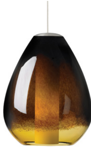
dark brown/light amber