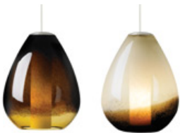
dark brown/light amber