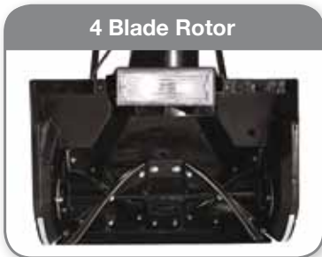
4 Blade Rotor

Like the Snow Joe® 322P, the Snow Joe® Ultra SJ621, is powered electrically, making it effortless to start and maintain. No gas, oil, or tune-ups are necessary. The unit is ETL-approved and carries a full two year warranty. For heavier snowfall on large driveways and walkways, the Snow Joe® Ultra SJ621 is your smart solution this winter.