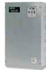
Optional Automatic Transfer Switch