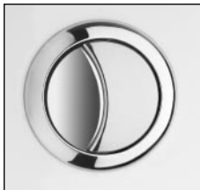
Dual-Max Technology: Optional 1.6 Gpf / 6 Lpf or 0.9 Gpf / 3.4 Lpf