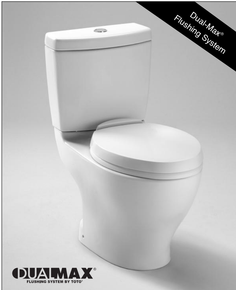
CST416M - Aquia® II Toilet SS204 - SoftClose® Oval Seat